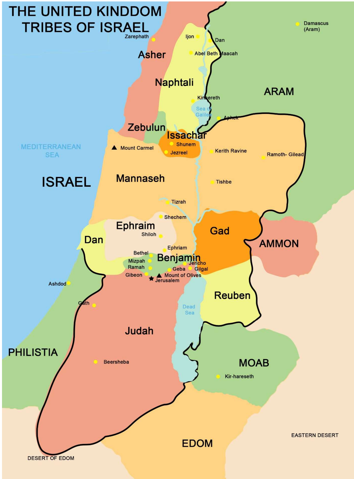
MAP 1 THE UNITED KINGDOM OF ISRAEL